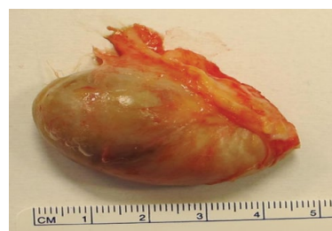
Figure 3 Intact cyst after removal.