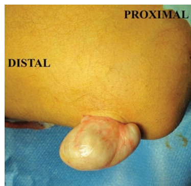
Figure 2 Intraoperative photograph showing the cyst delivered through the skin incision.