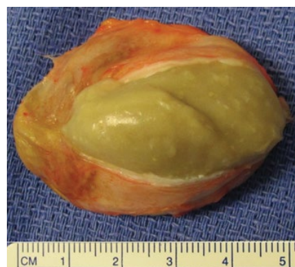
Figure 4 Cyst after it was opened on the back table of the OR, demonstrating the green, cheese-like substance that was contained inside.